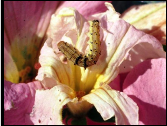
~ Caption: Tobacco budworm feeding on petunia blossom