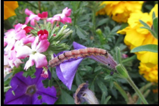
~ Caption: Tobacco budworm (red form) feeding on petunia