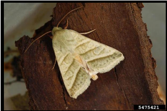
~ Caption: Adult tobacco budworm moth ~ Photo by: J. Berger, bugwood.org