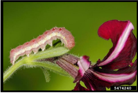
~ Caption: Red form of tobacco budworm on petunia