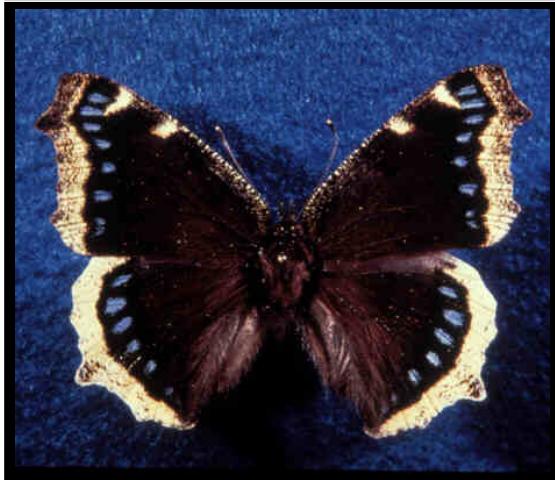
~ Caption: Spiny elm caterpillar adult ~ Photo by: S.J. Collman