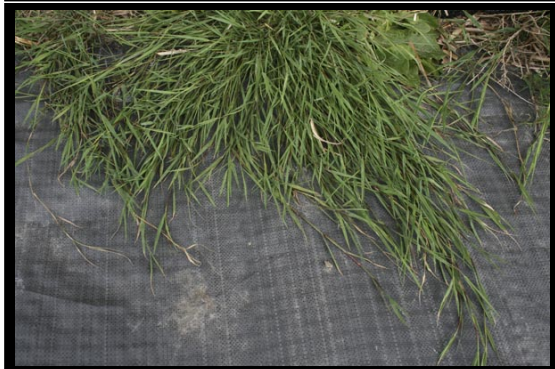
~ Caption: Creeping bentgrass ~ Photo by: T. W. Miller