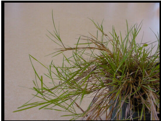
~ Caption: Creeping bentgrass ~ Photo by: B.M. Johnson