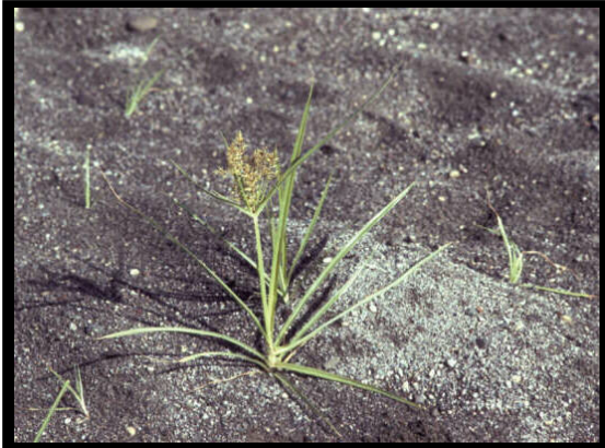
~ Caption: Yellow nutsedge ~ Photo by: Washington Noxious Weed Board slide collection