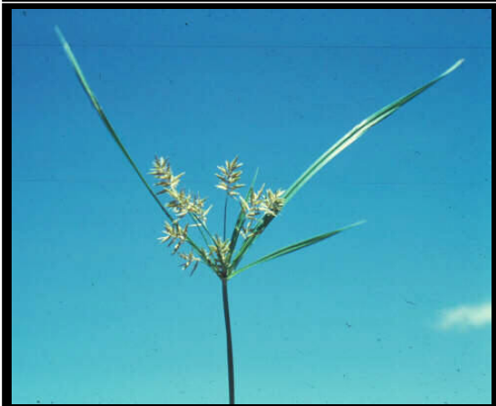
~ Caption: Yellow nutsedge flowers