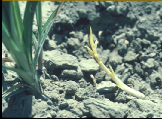
~ Caption: Yellow nutsedge bulb sprout ~ Photo by: C.A. Rice