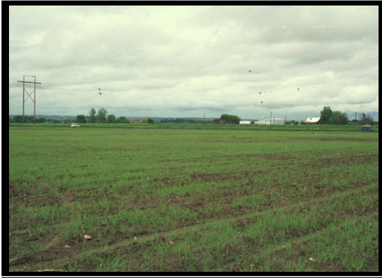
~ Caption: Yellow nutsedge in field ~ Photo by: C.A. Rice