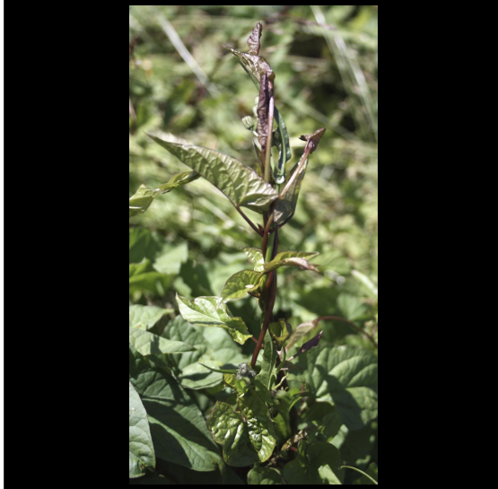
~ Caption: Hedge bindweed twining