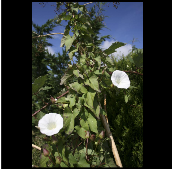
~ Caption: Hedge bindweed ~ Photo by: T. W. Miller