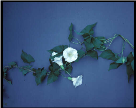
~ Caption: Hedge bindweed flower