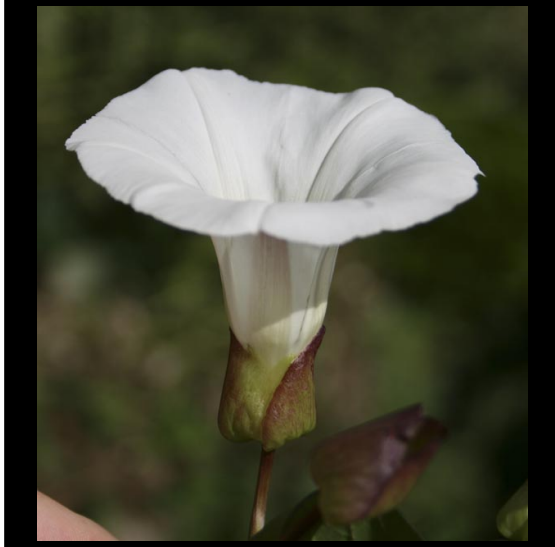
~ Caption: Hedge bindweed flower ~ Photo by: T. W. Miller