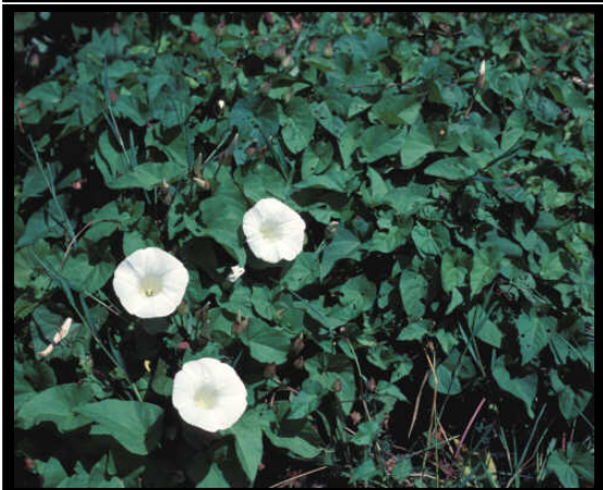
~ Caption: Hedge bindweed with flowers ~ Photo by: D.G. Swan