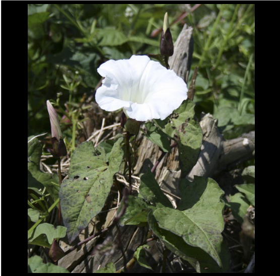
~ Caption: Hedge bindweed ~ Photo by: T. W. Miller