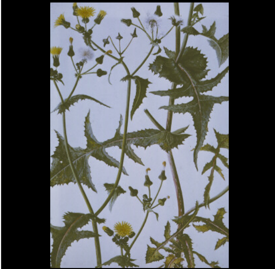
~ Caption: Line drawing of annual sowthistle ~ Photo by: Ciba Geigy