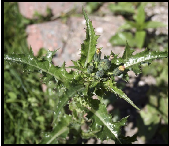
~ Caption: Spiny sowthistle