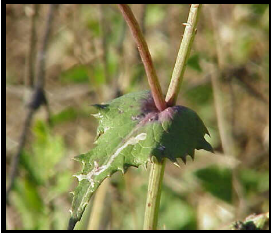
~ Caption: Annual sowthistle leaf at base of stem ~ Photo by: J.A. Kropf