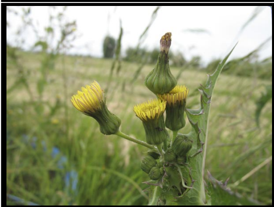
~ Caption: Annual sowthistle flower heads ~ Photo by: T. W. Miller