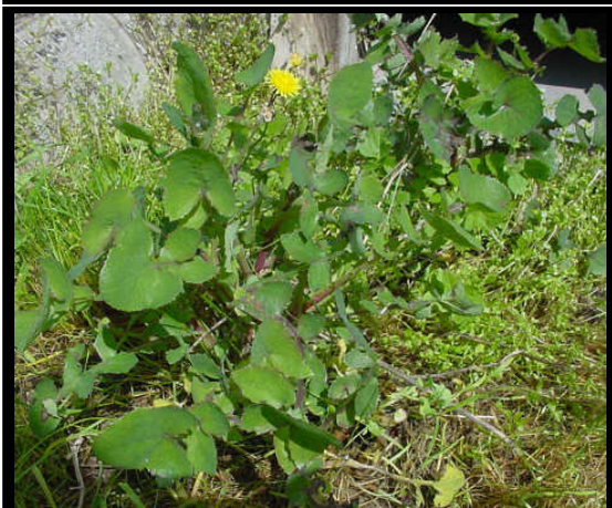
~ Caption: Annual sowthistle