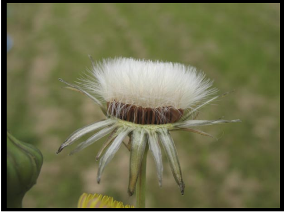
~ Caption: Annual sowthistle mature head ~ Photo by: T. W. Miller