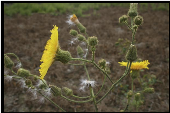
~ Caption: Perennial sowthistle glandular hairs