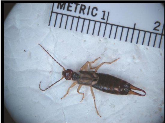
~ Caption: An adult European earwig ~ Photo by: M. Bush