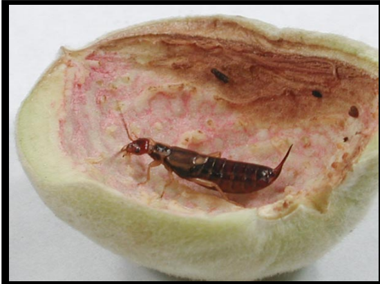
~ Caption: European earwig found feeding on interior of peach ~ Photo by: M. Bush