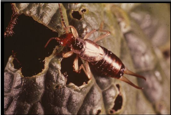
~ Caption: European earwig ~ Photo by: Unknown