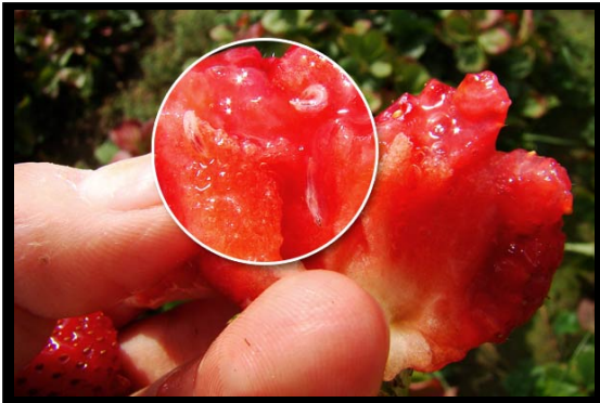
~ Caption: ~ Photo by: W. Hoashi-Erhardt