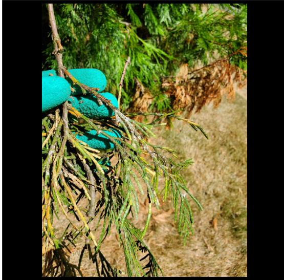
~ Caption: Seiridium canker