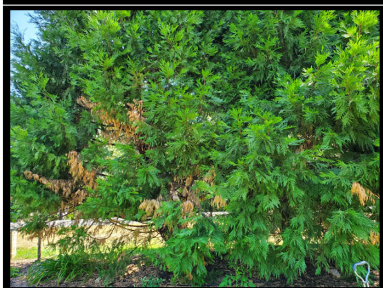
~ Caption: Seiridium canker flagging symptoms ~ Photo by: M. Harris