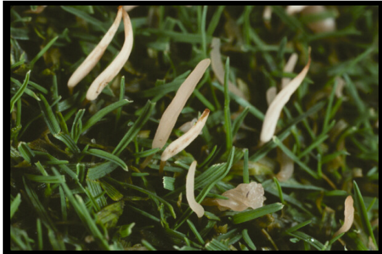
~ Caption: Typhula blight fruiting bodies