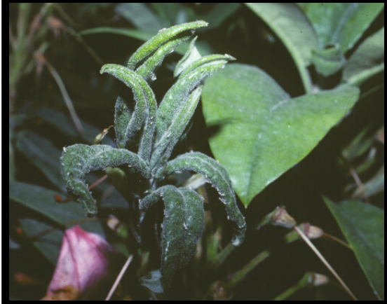
~ Caption: Aphid damage on rhododendron ~ Photo by: A.L. Antonelli