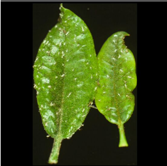
~ Caption: Aphid cast skins ~ Photo by: R.S. Byther