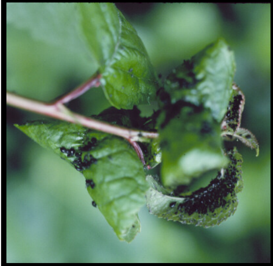
~ Caption: Black cherry aphids