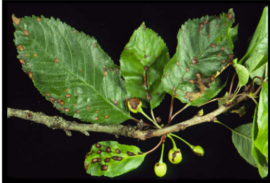
~ Caption: Coryneum blight symptoms on leaves and fruit