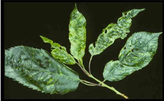
~ Caption: Cherry mottle leaf virus symptoms ~ Photo by: R.S. Byther