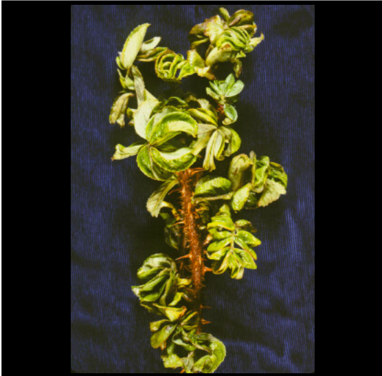
~ Caption: Rose spring dwarf virus