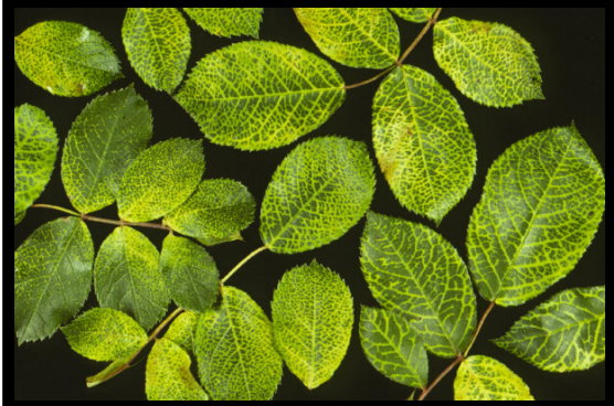
~ Caption: Rose mosaic vein-clearing symptom ~ Photo by: R.S. Byther