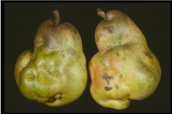
~ Caption: Pear stony pit virus symptoms ~ Photo by: R.S. Byther