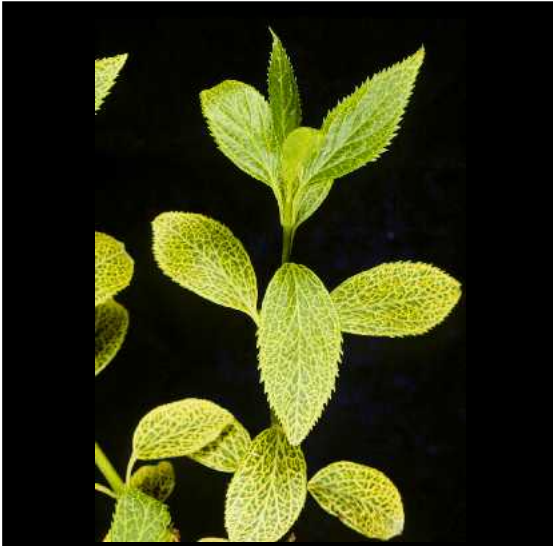
~ Caption: Tobacco ringspot virus/Arabis mosaic virus on Forsythia ~ Photo by: R.S. Byther