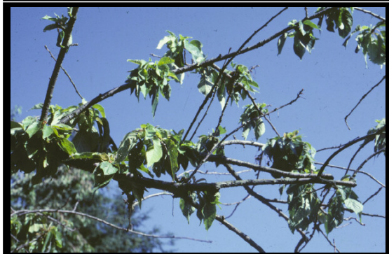
~ Caption: Virus "rat-tail" symptoms ~ Photo by: R.S. Byther