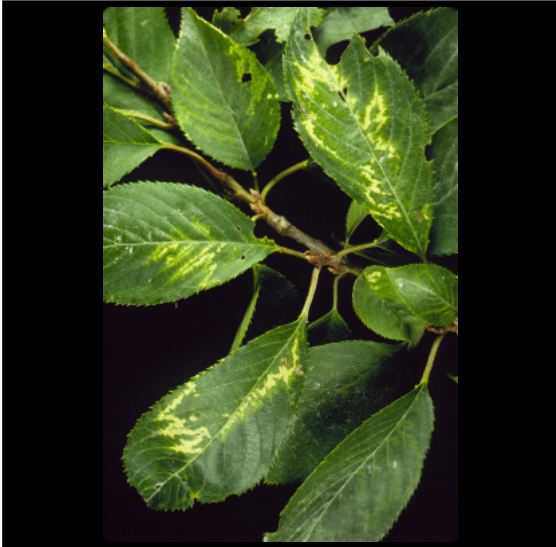
~ Caption: Prunus virus ~ Photo by: R.S. Byther