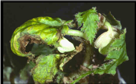
~ Caption: Impatiens necrotic spot virus on begonia ~ Photo by: R.S. Byther