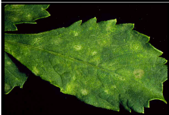
~ Caption: Tomato spotted wilt virus symptoms on dahlia