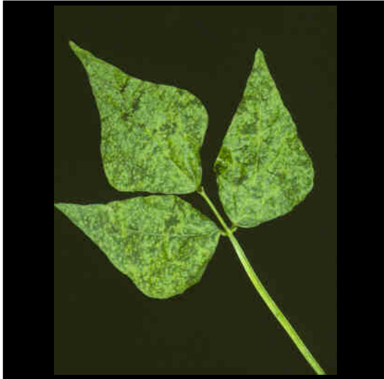
~ Caption: Bean yellow mosaic virus symptoms ~ Photo by: R.S. Byther