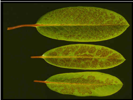
~ Caption: Rhododendron necrotic ringspot virus