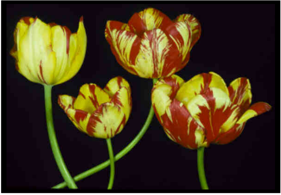
~ Caption: Tulip break (virus) ~ Photo by: R.S. Byther