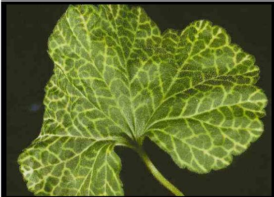
~ Caption: Geranium virus symptoms