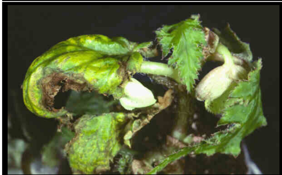
~ Caption: Impatiens necrotic spot virus on begonia ~ Photo by: R.S. Byther