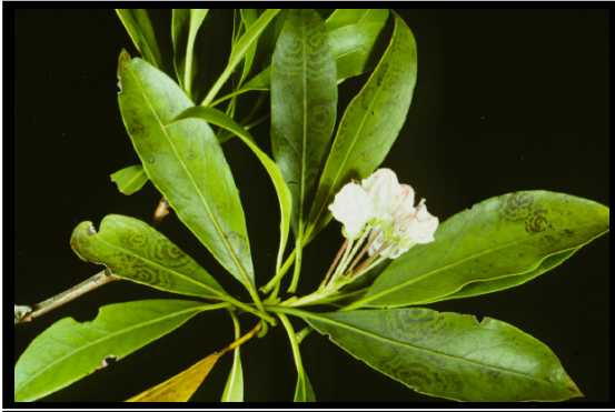
~ Caption: Kalmia necrotic ringspot virus ~ Photo by: R.S. Byther