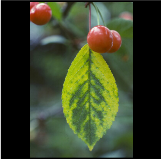
~ Caption: Sour cherry virus symptoms ~ Photo by: R.S. Byther