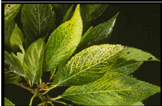
~ Caption: Vein-clearing symptom of virus infection ~ Photo by: R.S. Byther