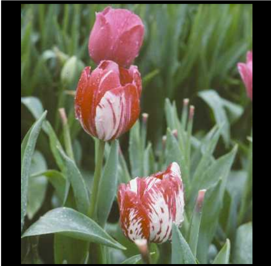
~ Caption: Tulip break (virus) ~ Photo by: R.S. Byther