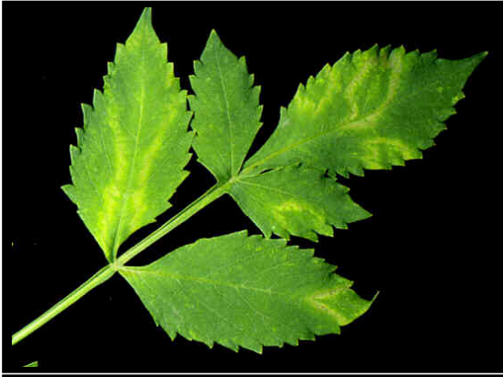
~ Caption: Virus symptoms on dahlia