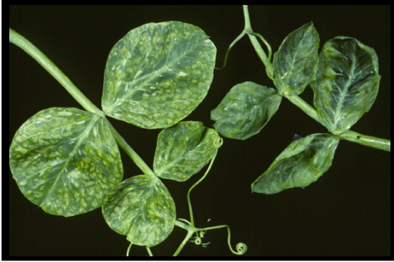
~ Caption: Pea mosaic virus ~ Photo by: R.S. Byther