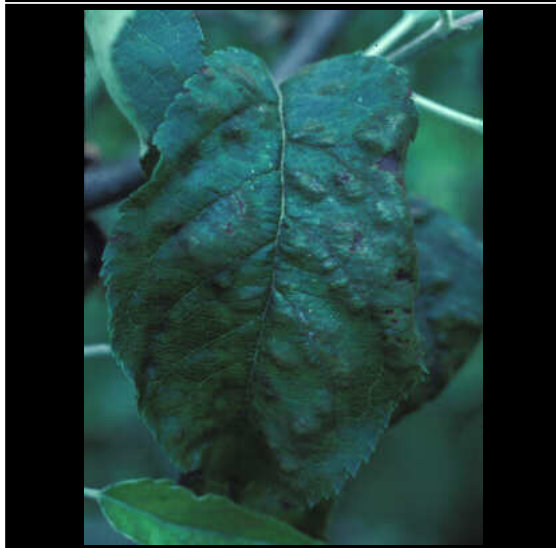
~ Caption: Apple scab on leaf ~ Photo by: R.S. Byther