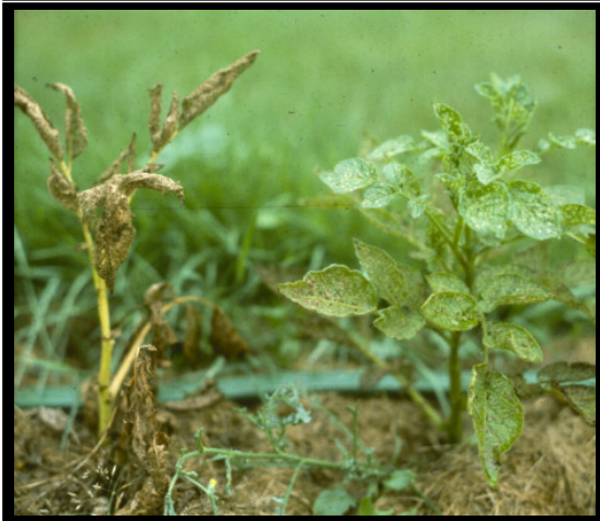
~ Caption: Adult flea beetle damage on potatoes ~ Photo by: S.J. Collman