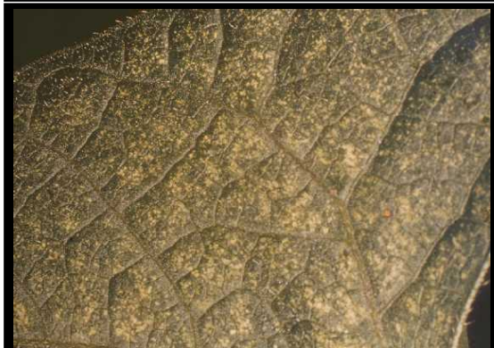
~ Caption: Spider mite damage on leaf