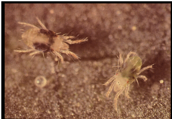
~ Caption: Spider mites under microscope ~ Photo by: L.K. Tanigoshi