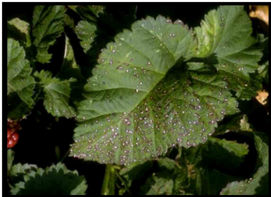
~ Caption: Blackberry leaf spots ~ Photo by: OSU slide library