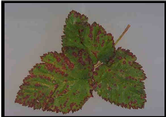
~ Caption: Blackberry leaf spots ~